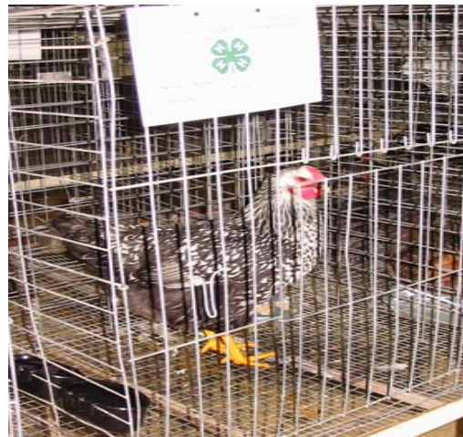
Flock owners are encouraged to participate in this program as Subpart E Participants